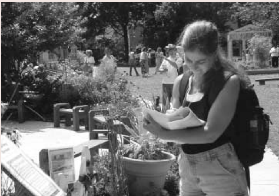
Tuckahoe Elementary School's children's garden, 2003 Children & Youth Garden Symposium.

Over the years, nearly 100 separate AHS reference books have found a place on the bookshelves of American gardeners. The AHS A-Z Encyclopedia of Garden Plants—has sold over 200,000 copies.