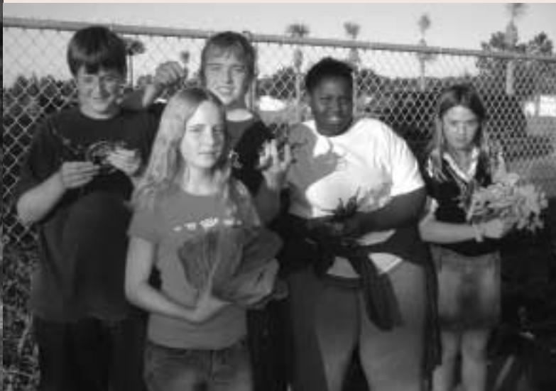
Schoolchildren in The Growing Connection program show off their harvest.