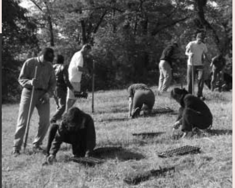
Staff and volunteers planting the André Bluemel Meadow at River Farm.

To support the Society's ongoing publication program, the AHS maintains heat tolerance and cold hardiness codes for more than 30,000 plants in the Showtime® database.